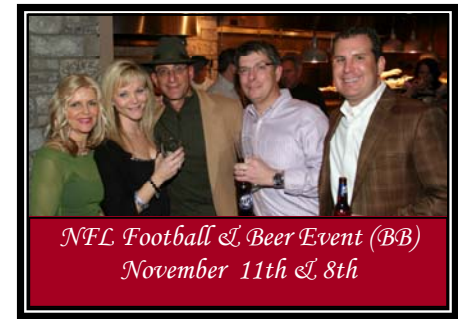
NFL Football & Beer Event (BB) November 11th & 8th

The Legend at Brandybrook 1 Legend Way Wales, Wisconsin 53183