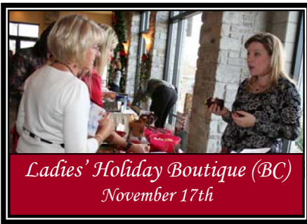
Ladies' Holiday Boutique (BC) November 17th